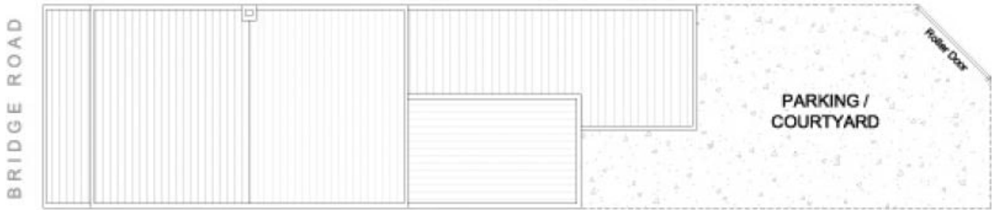
SITE PLAN (at reduced scale)