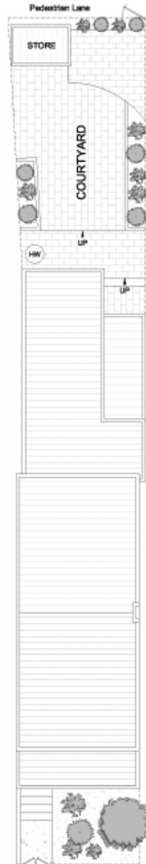
SITE PLAN (at reduced scale)