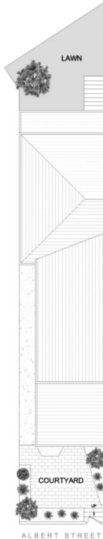
SITE PLAN (at reduced scale)